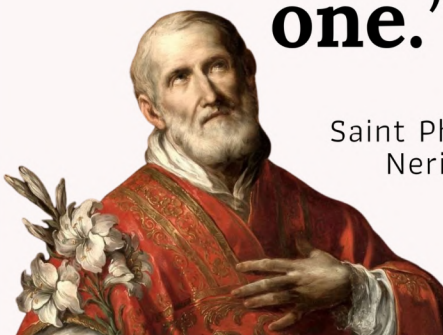
Saint Philip Neri

“A joyful heart is more easily made perfect than a downcast one.”